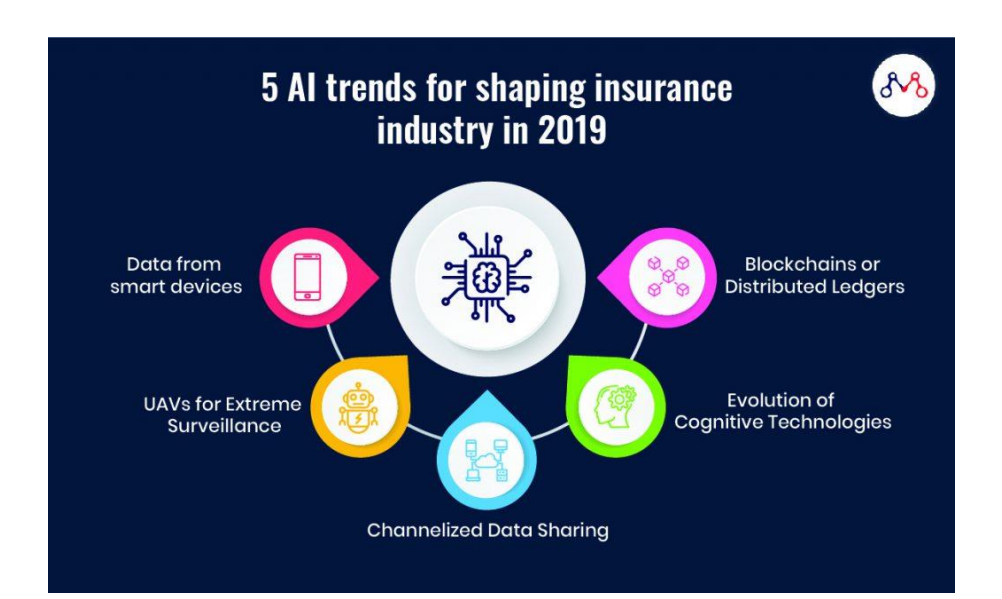
Figure 3: AI Trends in the Insurance Industry